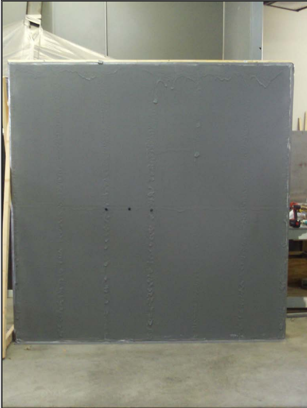
Photo No. 2 Control Wall