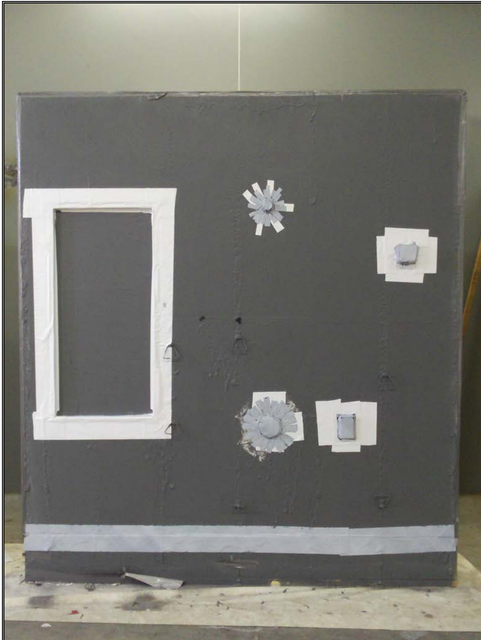
Photo No. 1 Penetrated Wall